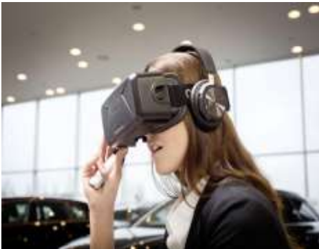
Oculus Rift affordable virtual reality

https://www.justgiving.com/one-trust/donate/